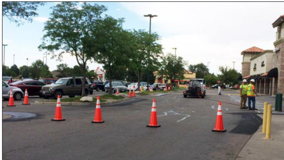
Cones block usual access to King Soopers and other businesses in the Palizzi Marketplace at Fourth Avenue and Bromley Lane. Work continues on the shopping area's parking lot.